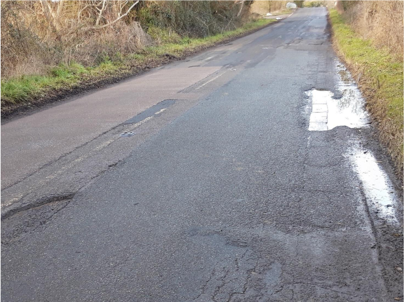
Laying water and wear is revealing the original road surface

That would seem to be enough but leaving the village to go to Tenterden is even worse. From the bottom of Gardiner's Hill to New Bridge is in such a poor state that only a non resident would consider it sensible to drive above 20mph. It is the perfect place for car manufacturers to come and test out their cars suspension as they have a 50 -100 metre stretch available. Again, the holes are repaired or patched but to no avail. The first patches are now eroding at the edges as the original road is in such poor condition. It is just papering over the cracks.