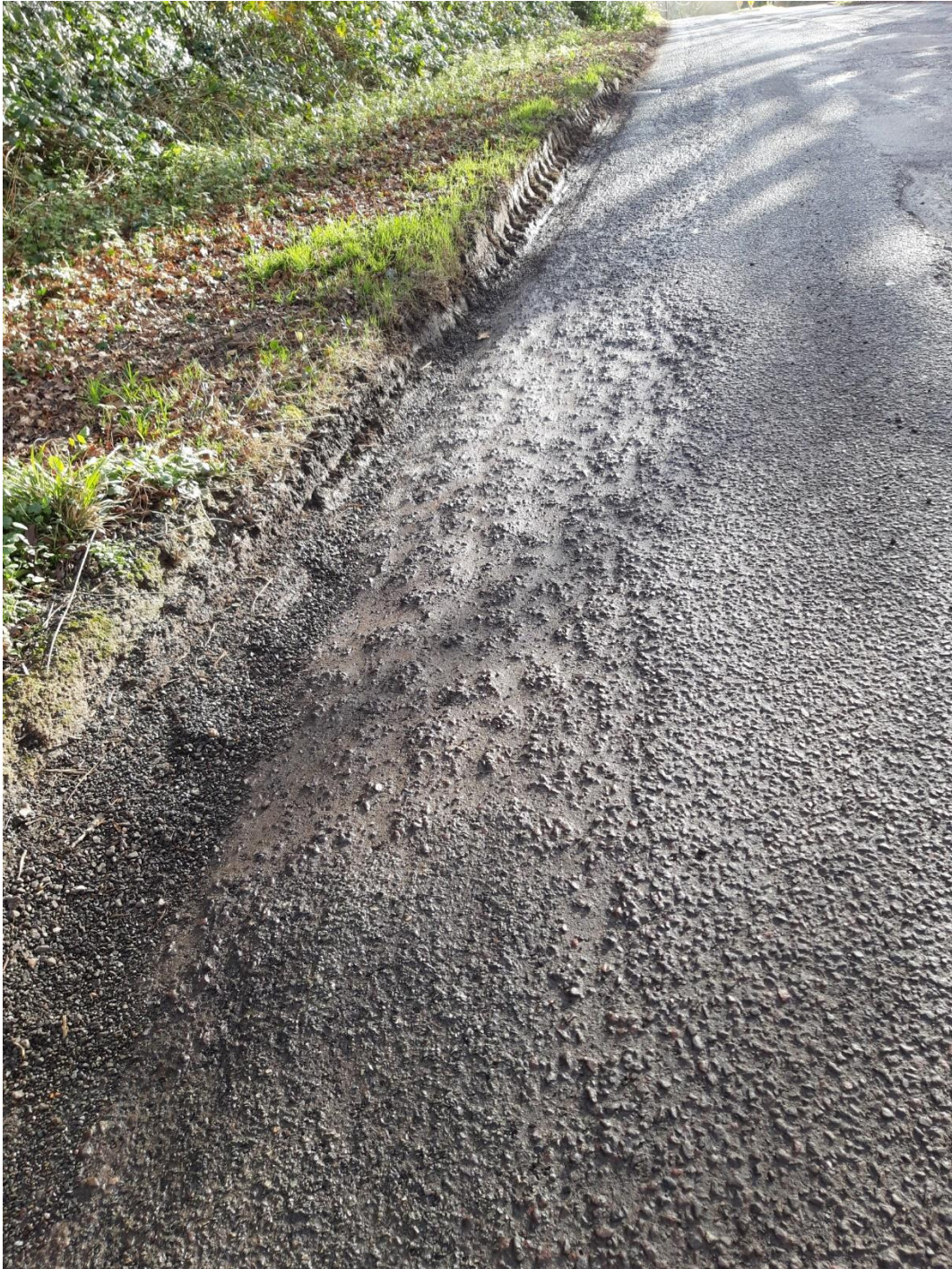
Peace & Plenty

The state of the road surface at the Peace and Plenty, the junction of the B2082 and the Rye Road, has been referred to at all council meetings for over a year now. The potholes have been repaired, to reappear and then be filled again so many times that the breath of the road is like the craters on the moon. Drivers are eroding the verges either side to avoid the holes which act like invisible speed ramps on a vehicle's suspension. Sadly, these are not considered deep enough for you to take action. I attach photos but it is not easy to be able to show you the issue.