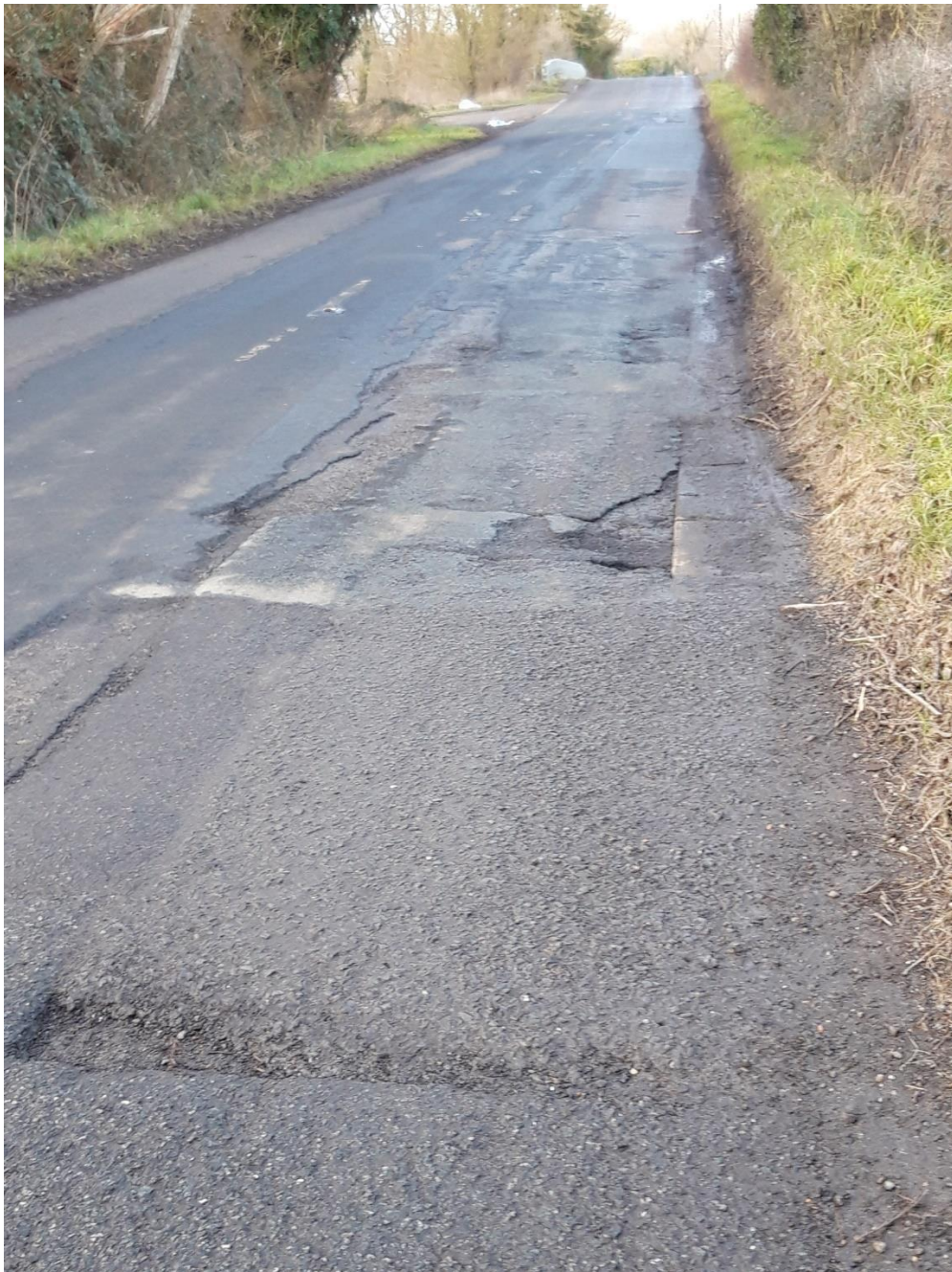
Gardiner's Hill to New Bridge – Wittersham Road

In the centre of the village the two sharp bends have multiple potholes and the road between the two has been worn away back down to original red surface. Potholes appearing now are much deeper as a result.