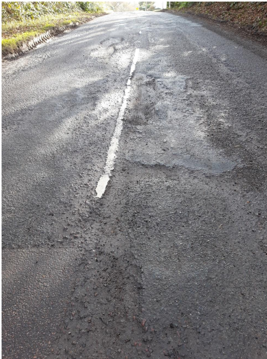
Peace & Plenty

We are forced to write to you directly as a result of the dreadful condition of the roads into Iden and on to Wittersham.